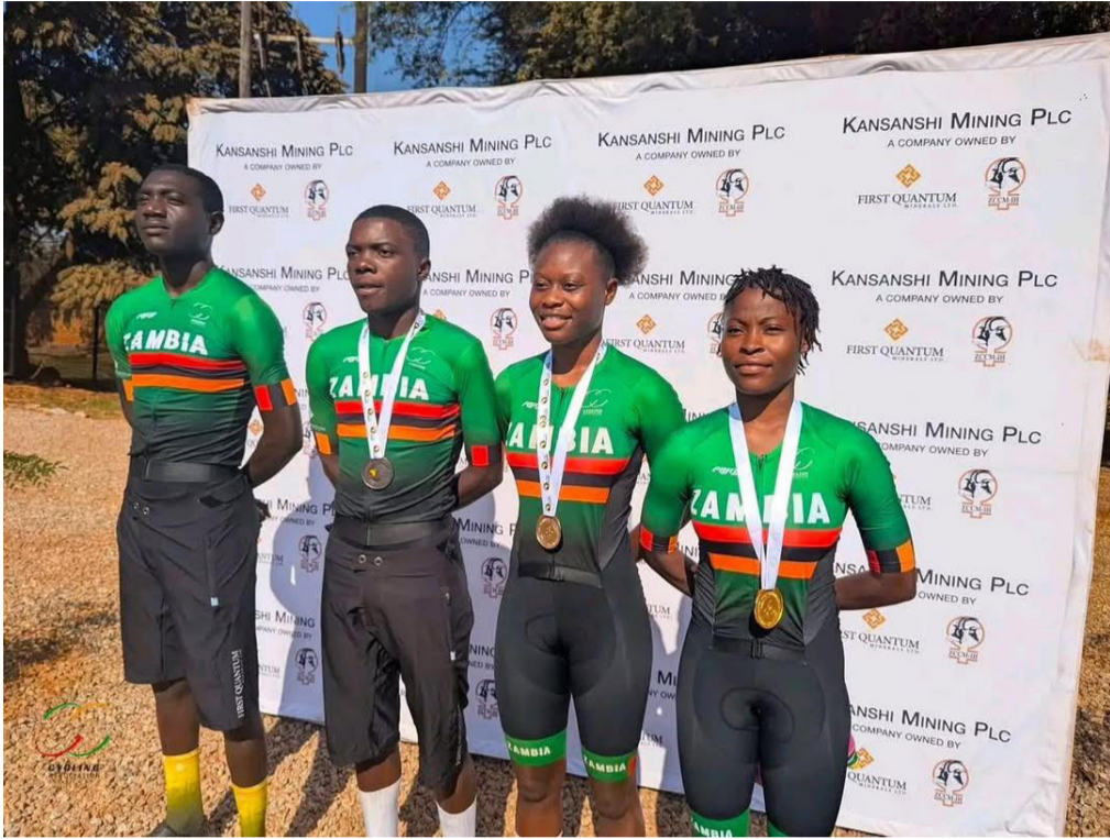
Kansanshi Mining PLC has honoured Zambia's young cycling champions with a hero's welcome following their outstanding performance at the African Continental Cycling Championships held in Ivory Coast.

By Staff Reporter Kansanshi Mining PLC has honoured Zambia's young cycling champions with a hero's welcome following their outstanding performance at the African Continental Cycling Championships held in Ivory Coast. The cyclists, who represented Zambia with distinction on the continental stage,