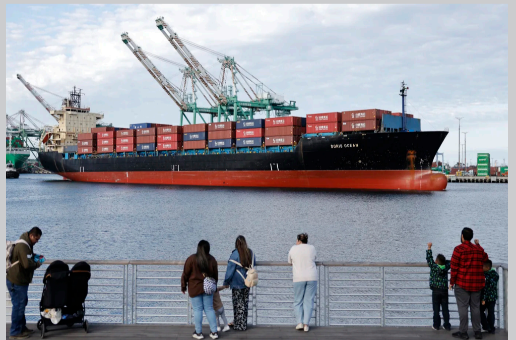
People watch as the Doris Ocean container ship departs from the Port of Los Angeles on May 28, 2026 in Los Angeles, California.

The proposal comes after the U.S. Supreme Court struck down most of President Donald Trump's "Liberation Day" tariffs earlier this year, prompting him to impose 10% global baseline duties under Section 122 — which are also set to expire in July.