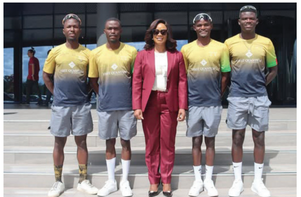
FILE: The Kansanshi Cycling Team has received a warm welcome back home following an impressive performance at the Absa Cape Epic in South Africa.